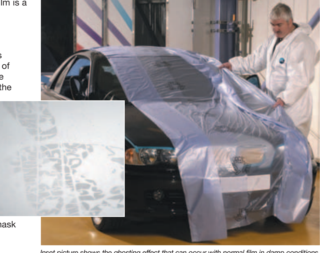
Inset picture shows the ghosting effect that can occur with normal film in damp conditions

The static cling properties of the film, and its 4 metre width (folded to 1 metre on the mobile dispenser) allow a rapid, one person application. The static cling holds every contour of the vehicle to eliminate overspray reaching the vehicle under the film.